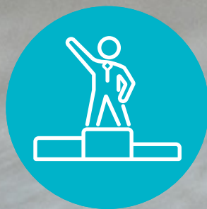
Optimized Working Conditions