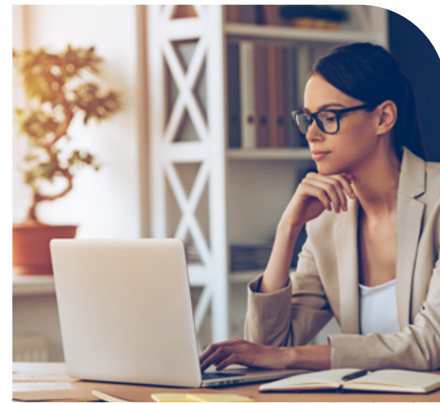
PEACE OF MIND Against Vandalism