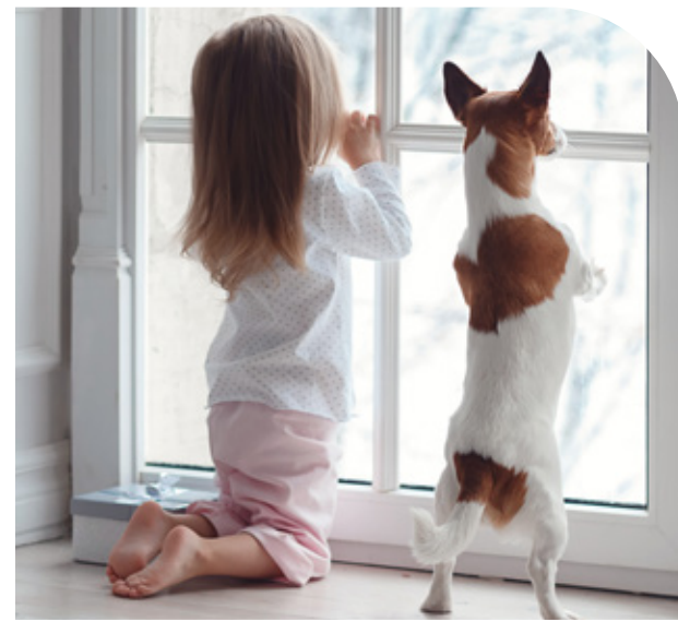
PREVENT Against Forced Entry

LLumar® Safety Films considerably increase the resistance of glass to break-ins, vandalism and explosion shock waves. They are categorised as defined laminated safety glass types (EN356, GSA Level 2).